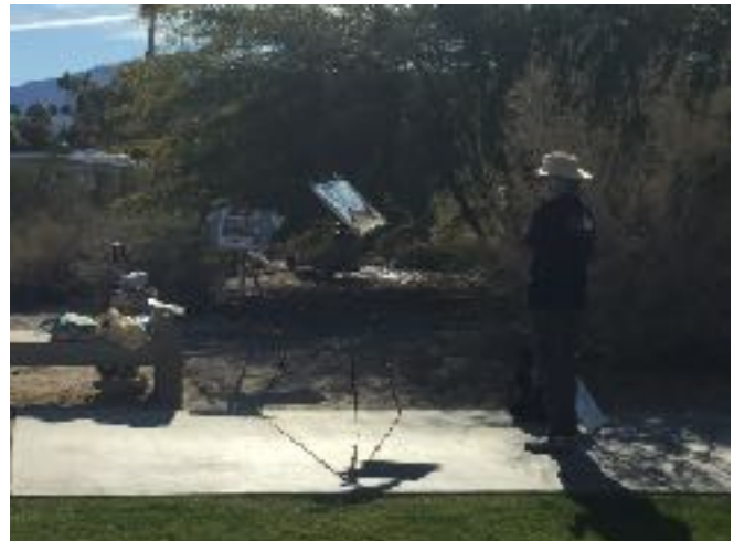
Plain Air at Ironwood Park, January 20th.