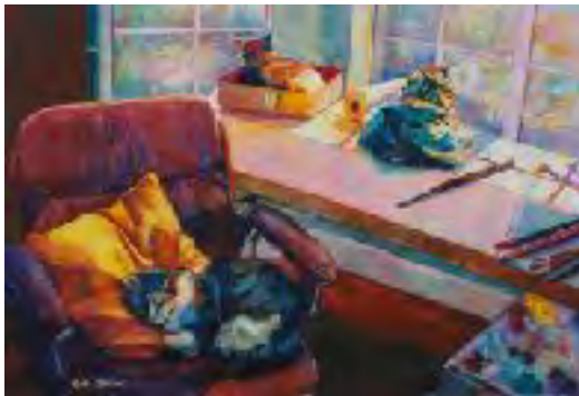
Robin St Louis - 1st place

Paintings from CVWS members shown below were accepted into the San Diego Watercolor Society monthly members Show. The paintings are now hanging in their gallery.