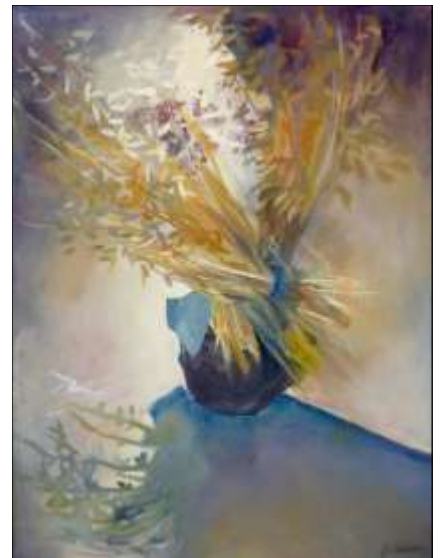
“Reflection” Veronique Branger