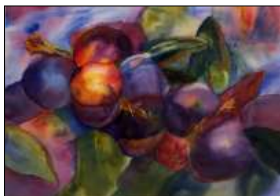
Traditional 1st Place Elaine Trei