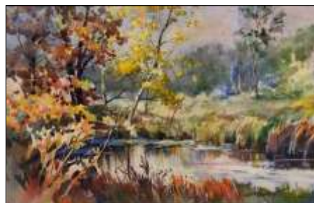
Plein Air 1st Place Nels Femrite