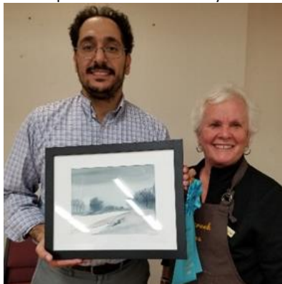
View on a Snowy Morning

(Award accepted on her behalf by her husband)