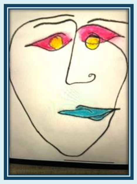
Who are you?