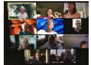
A recent CVWS Zoom Board Meeting

If this fails, type in: “Cozy Grammar” and you’ll find a number of videos that you can choose from, including “Joining a Zoom Meeting for the First ...etc.”