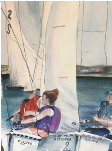
By Charlie Lerner

This summer Charlie Lerner was juried into the Riverside Arts Council's Artscape Exhibition. The Council is connected with Art in Public Places for California.