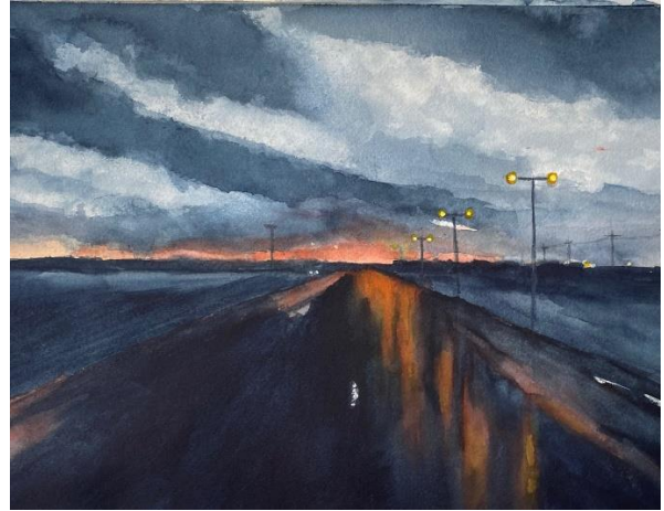
THE STORM By Charlie Lerner