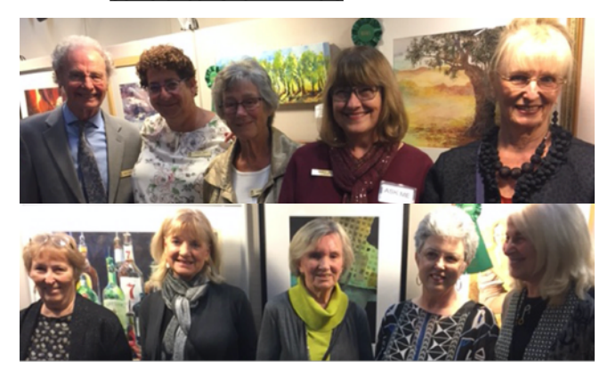
Some of our Show Winners

Each category awarded a "Best", 1st, 2nd, & 3rd prizes, plus numerous honorable mentions. Also Best of Show, Publicity and (2) "Emerging Artist" prizes were awarded. Due to the large number of graphics, it's best that you see all winning images online at <a href="cvws.org">cvws.org</a> rather than trying to download them in a newsletter format. Our gracious judge wrote 38 detailed critiques about his decisions and these comments are available online at <a href="cvws.org">cvws.org</a> adjacent to each winning painting.