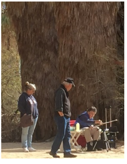
Thousand Palms Preserve

March 19 Thousand Palms Preserve 29200 Thousand Palms Canyon Road Thousand Palms Bring a lunch!