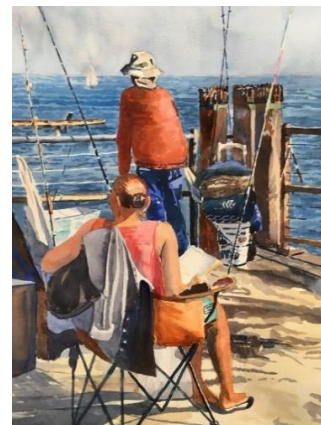
Redondo Pier