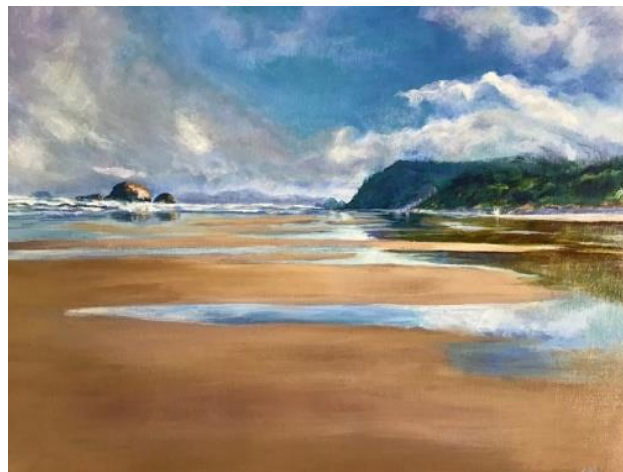
Cove Beach by Suzy Voss