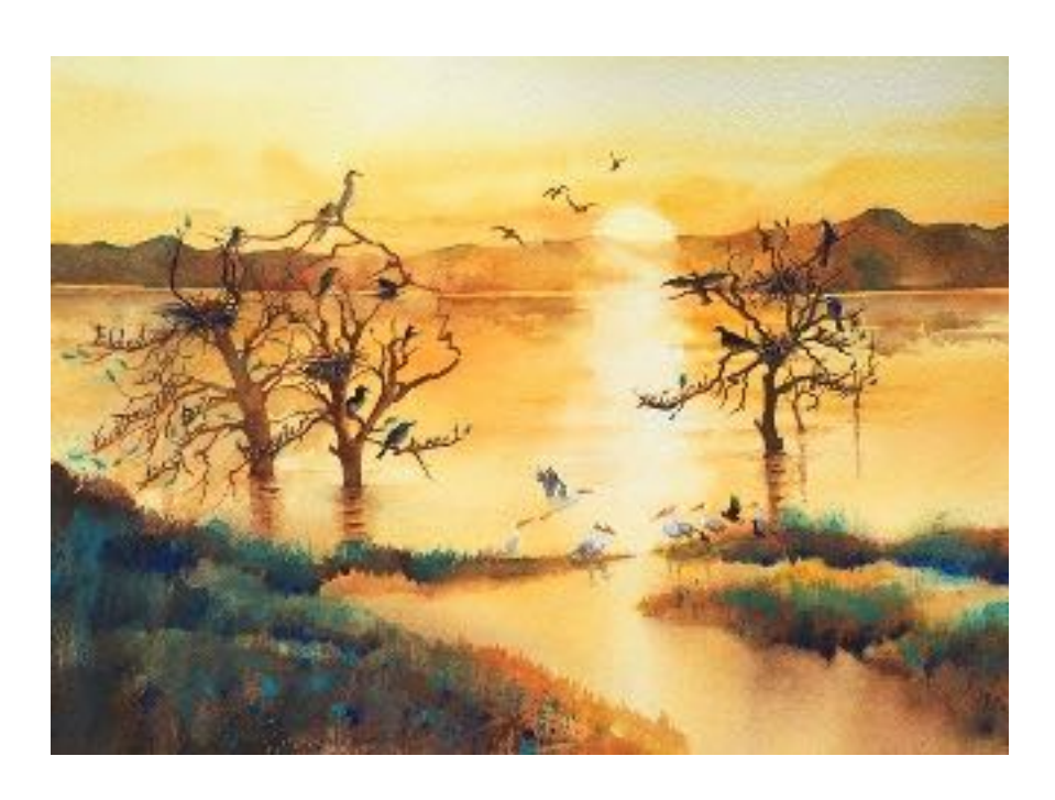
The SDWS Cover photo for November. depicting the Salton Sea, with clever hidden images, is by Sylvia Smith .