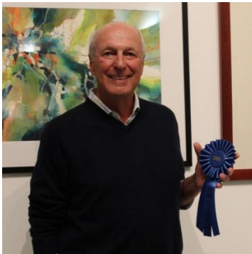
1 st Place: Sunlight & Shadows by Mike Pascavage