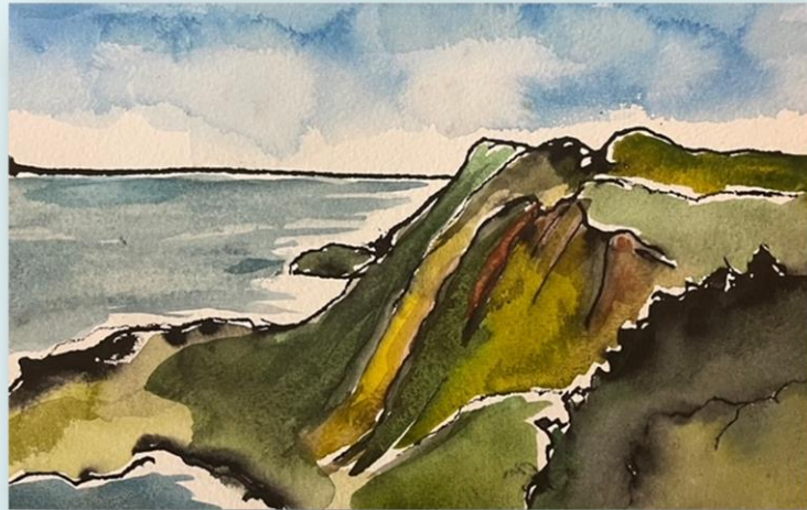
Watercolor Molokai Hawaii

A book publisher by trade, she splits her time between Venice Beach and Pinyon Pines. Originally from Michigan, she grew up in the San Fernando Valley, spent most of her later years in Southern California, and settled in Venice Beach.