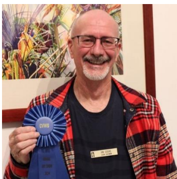
1 st Place: Flashy Lily by Ian Cooke