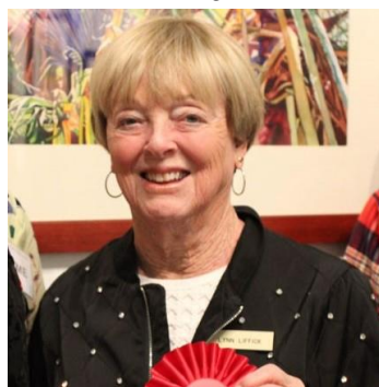
2 nd Place: A World Beyond by Lynn Liffick