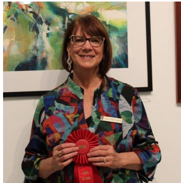
2 nd Place: Cotton Candy Sunrise by Leslie Skuchas