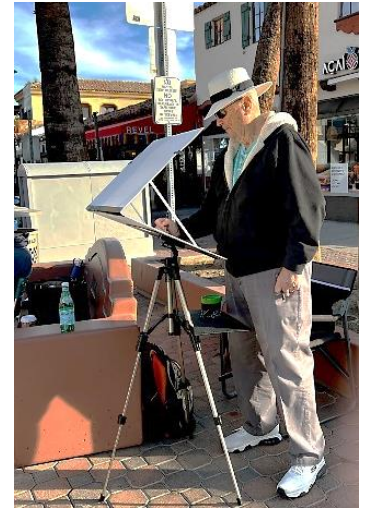
Bob Hannah Downtown Palm Springs