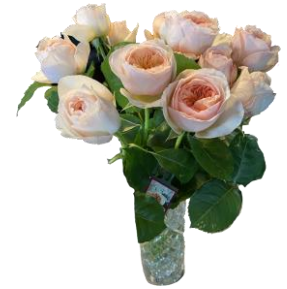
Sent by family on 1st Day of Annual Show

Rejected! But why? Was it simply because two paintings were submitted and only one could be selected? Both paintings were trees. Were the colors too strong, the shapes unappealing? Was the other painting just better in the eyes of the judge? Maybe the other painting "Date Night" , that incorporated seeds to represent the dates on a date palm, better fit the show's experimental theme. Date Night sold at that show.