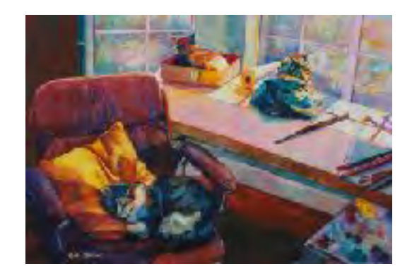
Robin St Louis - 1st place

Paintings from CVWS members shown below were accepted into the San Diego Watercolor Society monthly members Show. The paintings are now hanging in their gallery.